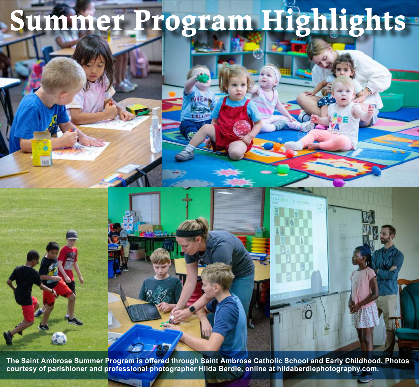
The Saint Ambrose Summer Program is offered through Saint Ambrose Catholic School and Early Childhood.

For more information on Early Childhood and our K-8 school, visit school.saintambrosecatholic.org and ec.saintambrosecatholic.org .