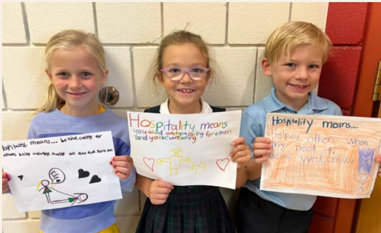
Three Saint Ambrose students display artwork defining hospitality. At a recent retreat, school staff defined it this way: "Hospitality is the generous welcoming of another, on their own terms, out of the love that comes from God."