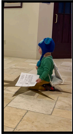
KNEELING BEFORE JESUS

I can enter with love and respect for Jesus by: