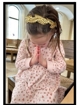
TALK TO GOD