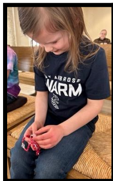
PRAY THE ROSARY