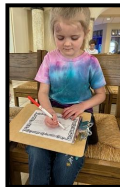
COLOR & PRAY